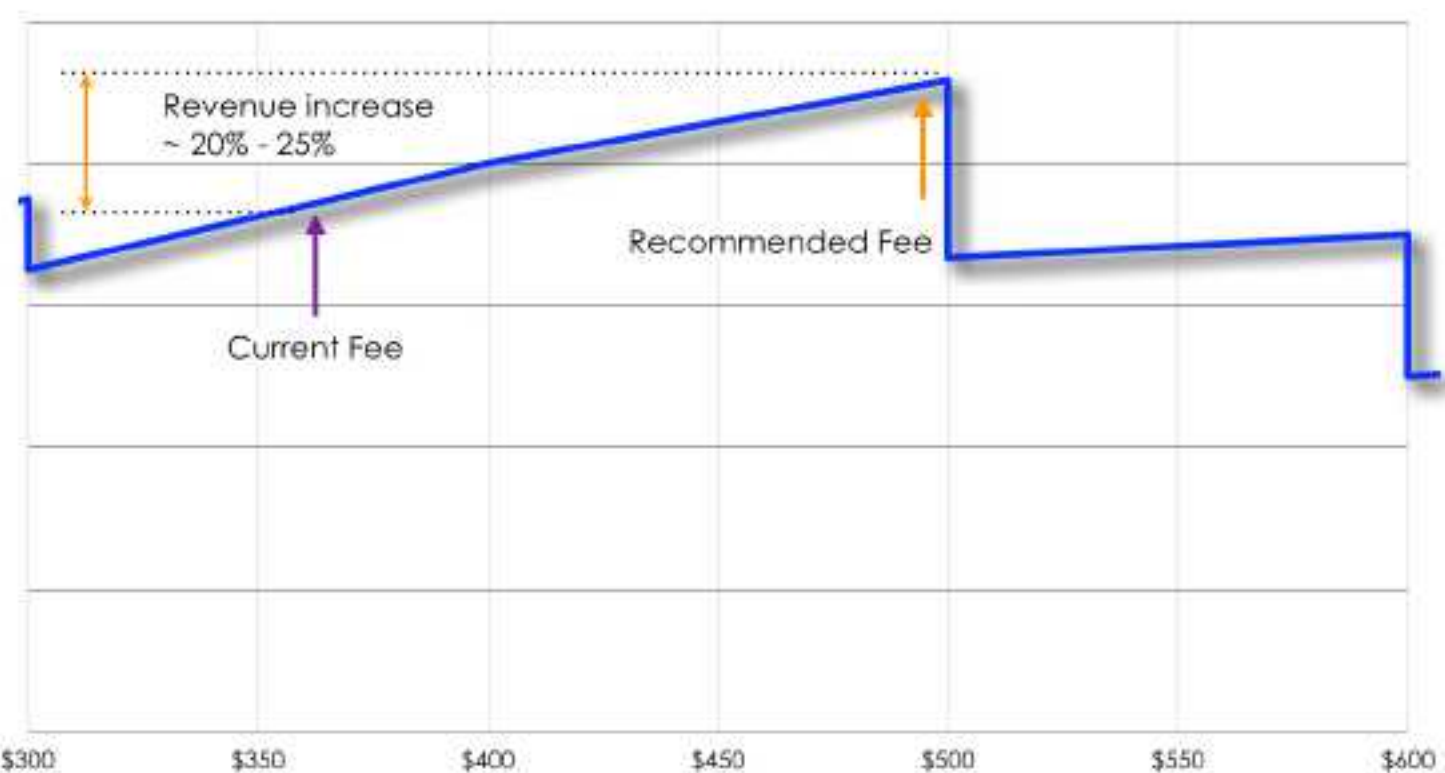
Modeling of the expected revenue after increase