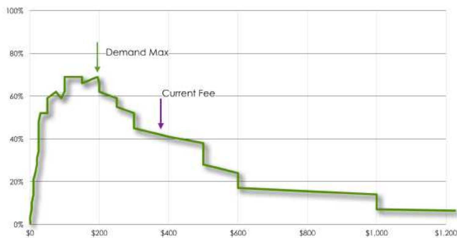
An overview of annual fee demand measurement

Demand being inelastic between $360 and at $495 means the company could expect a drop in subscribers of 4% when the price is increased to $495. However, this will generate revenues between 20–25% higher than at the current price.