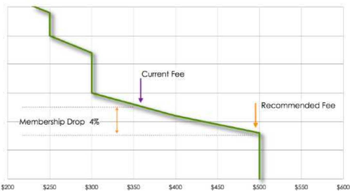
A zoom in to the interesting area of the annual fee measurement